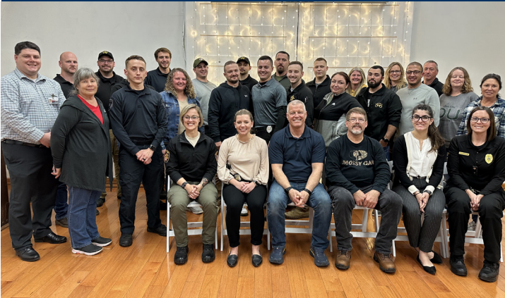
Left: 2023 CIT graduates, Below Community partners gather at Lake Hope Lodge for the Board's 2023 Annual Meeting.