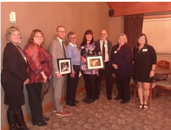
Hocking County Award Winners and 317 Hocking County Board Members