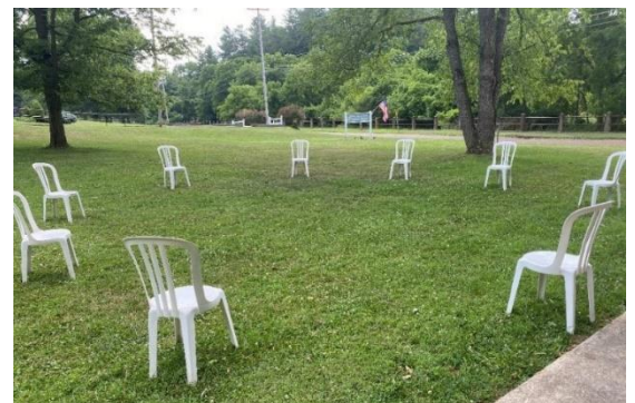
Social Distancing Twelve Step Meeting at the John W. Clem House